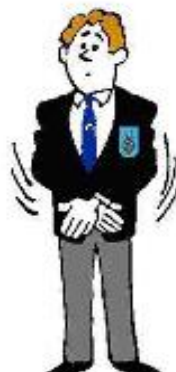
ADJUST JUDO GI