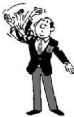
CHANGE OF SCORE