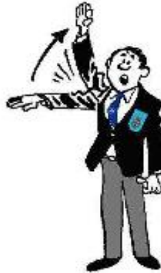
WAZA-ARI Awasete IPPON